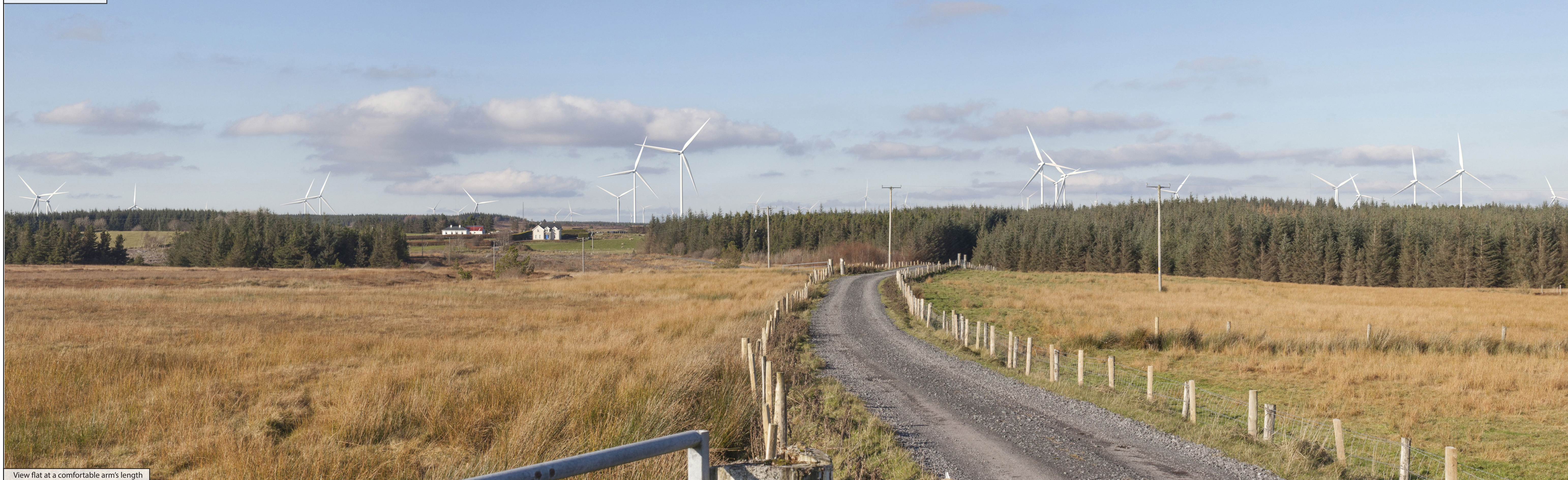
View flat at a comfortable arm's length

This planar projection panorama has been captured, prepared and presented in accordance with the guidance set out in the Scottish Natural Heritage 2017 guidance 'Visual Representation of Wind Farms'.